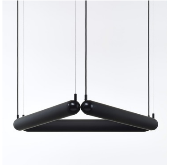
Shown in: Matte Black / Opaline Dark Grey

The Puro Contour Pendant offers a simple, yet striking design that will tie into a number of interiors with its minimalist nature. Named for the Spanish word for cigar, the pendant embodies that with its sleek cylindrical form that curves on each end of the linear form, with the body of the light serving as the diffuser for a soft ambient light, connected in multiples to create a geometric formation. Available with 3, 4, 5, or 6 lights with Triplex Opal or Opaline Dark Grey glass and a Matte Black or Matte White finish and cord. NOTE: Overall Height must be specified upon ordering. Cords are not field-adjustable. Please contact our sales team.