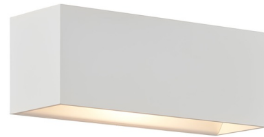
Shown in white / white

LAMP LIFE . . . . . 50000 hours COLOR RENDERING . . . . . 90 CRI LAMP COLOR . . . . . 3000K LUMENS/WATT . . . . . 67.65 LUMINOUS FLUX . . . . . 1150 lumens