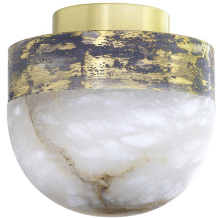
Shown in oxidized silvered brass / honed alabaster

The Lucid Ceiling Light / Wall Sconce, designed by Michael Verheyden, is inspired by Parisian brasseries and snow domes, creating a sculptural and functional piece. The Honed Alabaster is natural and markings will vary. May be used on the wall or ceiling.