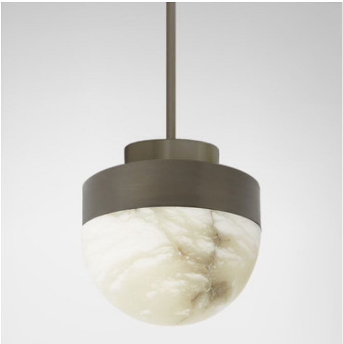
Shown in: Bronze / Honed Alabaster

The Lucid Pendant, designed by Michael Verheyden, is inspired by Parisian brasseries and snow domes, creating a sculptural and functional piece. Available with a Honed Alabaster shade paired with an Oxidized Silvered, Bronze, or Satin Brass finish. The Honed Alabaster is natural and markings will vary. Note: Standard stem length is 39.4 inches and is field adjustable. Custom stem length is available upon request. Please specify overall drop length when ordering.