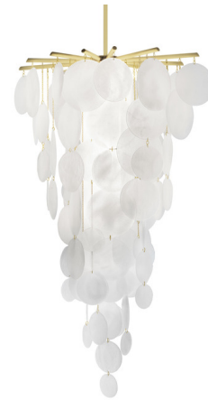
Shown in satin brass / fritted

The Nimbus Cascade Pendant creates a stunning masterpiece, with unique pieces of glass hand formed by artisans, producing crystal like textures. The Translucent glass is complemented by symmetrical metalwork. Due to the weight of the fixture, additional ceiling support is required. Note: Standard stem length is 39.4 inches and is field adjustable. Custom stem length is available upon request. Please specify overall drop length when ordering.