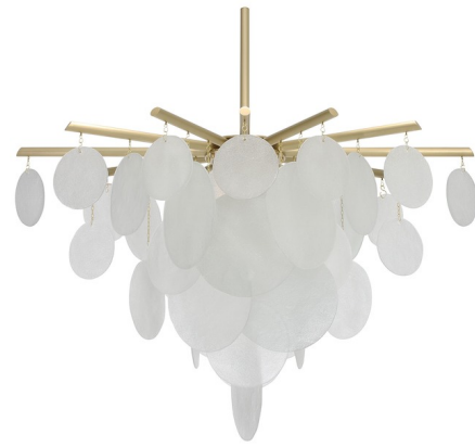
Shown in satin brass / fritted

The Nimbus Pendant creates a stunning masterpiece, with unique pieces of glass hand formed by artisans producing crystal like textures. The translucent fritted glass is complemented by symmetrical metalwork. Note: Standard stem length is 39.4 inches and is field adjustable. Custom stem length is available upon request. Please specify overall drop length when ordering. Due to the weight of the fixture, additional ceiling support is required.