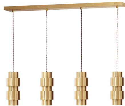
Shown in satin brass