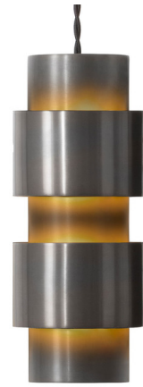
Shown in bronze

The Ring Pendant draws inspiration from chiaroscuro, the effects of strong light and shadows. The pendant's silhouette is composed of rings of differing size so the light emitted can highlight different aspects and create an overall dramatic, sculptural look. The interior of the shade is finished in Satin Brass to create warm, pleasant light. Note: Includes 39.4 inch flex cord (adjustable on site).