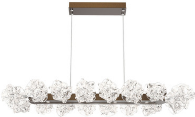
Shown in: Flat Bronze / Clear

The Blossom Linear Pendant features blossoms of LED lit hand blown glass that are meticulously crafted by Hammerton artisans. The fixture is a whimsical celebration of organic aesthetic that exudes casual sophistication. Each shade takes the place of a traditional bulb and unfolds with striking illumination. The finished look is relaxed, soft and unique. Each glass shade is a one-of-a-kind artisan creation. Note: 3000K color temperature available in Burnished Bronze finish only.