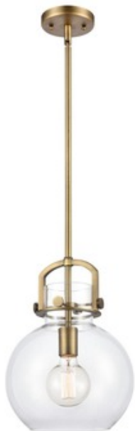
Shown in: Brushed Brass / Clear

The Newton Sphere Pendant is suitable for traditional, industrial and modern spaces alike. Hang multiple pendants for additional flair. Features a sphere shaped Clear glass shade with Matte Black, Brushed Brass or Brushed Satin Nickel finish. Available in two sizes. Choose from two lamping options. Ideally suited for vintage style bulb. LED option is dimmable with a LED compatible dimmer. UL/CUL listed. Suitable for damp locations. Slope ceiling compatible. Canopy: 4.5 inch diameter.