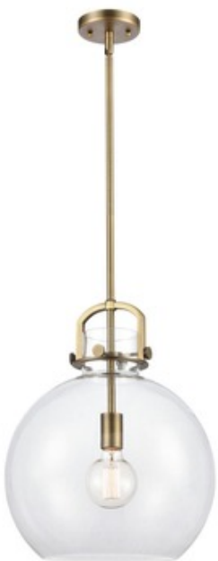
Shown in: Brushed Brass / Clear

The Newton Sphere Pendant is suitable for traditional, industrial and modern spaces alike. Hang multiple pendants for additional flair. Features a sphere shaped Clear glass shade with Matte Black, Brushed Brass or Brushed Satin Nickel finish. Available in two sizes. Choose from two lamping options. Ideally suited for vintage style bulb. LED option is dimmable with a LED compatible dimmer. UL/CUL listed. Suitable for damp locations. Slope ceiling compatible. Canopy: 4.5 inch diameter.