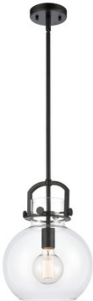
Shown in: Matte Black / Clear

The Newton Sphere Pendant is suitable for traditional, industrial and modern spaces alike. Hang multiple pendants for additional flair. Features a sphere shaped Clear glass shade with Matte Black, Brushed Brass or Brushed Satin Nickel finish. Available in two sizes. Choose from two lamping options. Ideally suited for vintage style bulb. LED option is dimmable with a LED compatible dimmer. UL/CUL listed. Suitable for damp locations. Slope ceiling compatible. Canopy: 4.5 inch diameter.