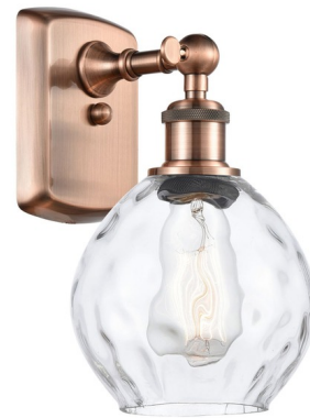
Shown in antique copper / clear

The Waverly Wall Sconce features a simple yet elegant design with a variety of finishes that allow the fixture to fit in seamlessly with any home decor. Complemented by a Clear glass shade.