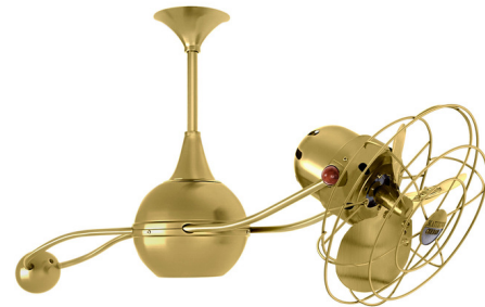
Shown in brushed brass