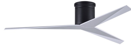
Shown in matte black / gloss white