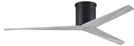
Shown in matte black / barn wood tone

The Atlas Fan Eliza Hugger Ceiling Fan features a unique blade shape designed to maximize air movement at the outer edge of the blade, resulting in more efficient air velocity rings, less blade drag, and greater motor optimization. DC motor constructed of cast aluminum and heavy stamped steel in Brushed Nickel, Matte Black or Gloss White finish with Brushed Nickel, Gloss White, Matte Black, Walnut, Barn Wood, Grey Ash, or Old Oak blades. 56 inch blade span and 27 degree blade pitch. Includes a 6-speed RF remote control with reverse function in Black, and a 6-speed wireless Decora-style wall control in White. ETL listed. All finishes rated for damp locations. Lifetime limited warranty.