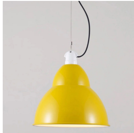
Shown in yellow

The BB1 Pendant is ideal for minimalist or industrial interiors. The a bell shape shade provides a good, general spread of background light. Made in the UK. UL listed.