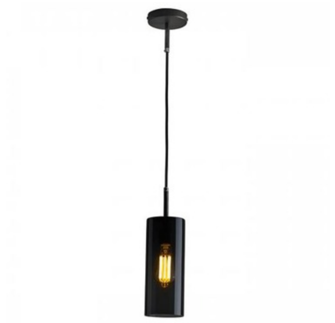
Shown in: Weathered Brass / Anthracite

The Brompton Pendant combines simplicity with elegance. The smooth Anthracite glass shade has a classical cylindrical shape, which is hand blown in England. Available in three sizes with a Weathered Brass ceiling rose and attractive Chrome detailing on the chord grip. Includes a Black cotton braid cord. Made in the UK. UL listed.