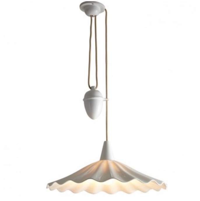
Shown in: White / Natural White

The Christie Rise and Fall Pendant is exquisitely handcrafted in Bone China whose shade resembles rolling ocean waves. The unique pully system allows you to customize the length any time you choose. Available in Natural White. Includes a sand and taupe cotton braid cable. Made in the UK. UL listed.