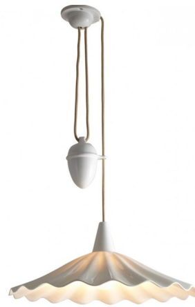
Shown in white / natural white