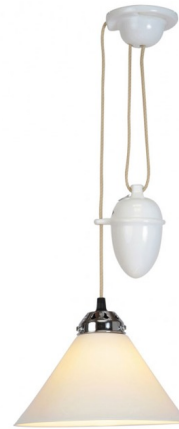
Shown in white / natural white

PRODUCT DIMENSIONS . . . . . Cable Length: 65"