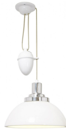
Shown in white / natural white