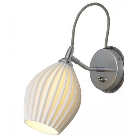
Shown in white / satin chrome

The Fin Wall Sconce is an eye catching piece with a Bone China shade that has been molded into a beautiful organic shape, creating dramatic light and shade when lit. Available in Natural White with a Satin Chrome finish and Grey cotton braid cord. On/Off switch is located on the backplate. Made in the UK. UL listed.