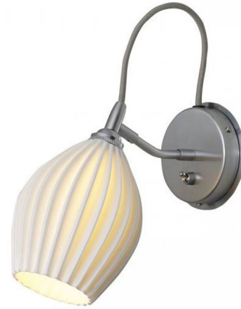
Shown in white / satin chrome

The Fin Wall Sconce is an eye catching piece with a Bone China shade that has been molded into a beautiful organic shape, creating dramatic light and shade when lit. Available in Natural White with a Satin Chrome finish and Grey cotton braid cord. On/Off switch is located on the backplate. Made in the UK. UL listed.