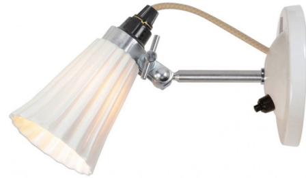
Shown in brushed steel / natural white

The Hector Pleat Switch Wall Sconce is a British design classic in Natural White bone china pleated shade. Head can adjust to direct light where you need it. Available in two sizes. On/Off switch is located on the backplate. Made in the UK. UL listed.