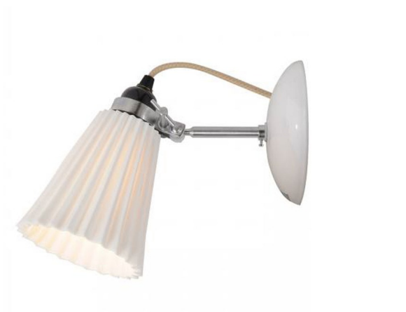
Shown in brushed steel / natural white

The Hector Pleat Wall Sconce is a British design classic in Natural White bone china pleated shade. Head can adjust to direct light where you need it. Available in two sizes. Made in the UK. UL listed.