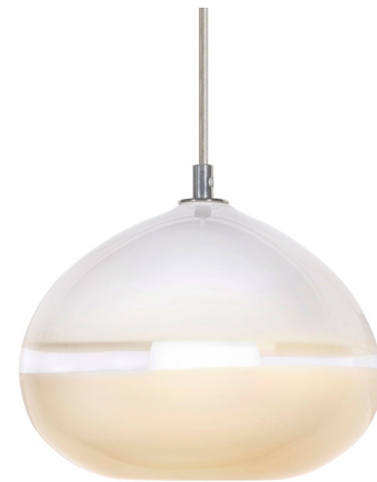
Shown in satin nickel / white / ivory

PRODUCT DIMENSIONS . . . . . Adjustable Fabric Cord Length: 72" COLOR RENDERING . . . . . 90 CRI LAMP COLOR . . . . . 2700K LUMENS/WATT . . . . . 87.50 LUMINOUS FLUX . . . . . 350 lumens