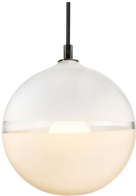
Shown in: Black / White / Ivory

The Lattimo Orb Pendant is a variation on the banded line, these pieces focus on their forms rather than the juxtaposition of colors. The name refers to the Italian technique of lattimo or milk glass. Two opaque swathes of color are wrapped around a clear crystal bubble. Made in California and signed by Caleb and Carmen. Note: Each piece of hand-blown glass is a unique work of art. Dimensions, weight, and color will vary. When multiple fixtures are installed next to each other, expect some variation in shape and color.