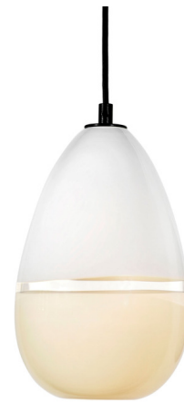
Shown in black / white / ivory

COLOR RENDERING . . . . . 90 CRI LAMP COLOR . . . . . 2700K LUMENS/WATT . . . . . 87.50 LUMINOUS FLUX . . . . . 350 lumens