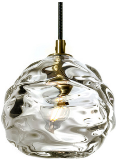
Shown in: Brushed Brass / Clear

The Happy Pendant brings a decorative beauty to your interior space. The hand blown, waved shade emits unique light shadows across your room. Made in California and signed by Caleb and Carmen. Note: Each piece of hand-blown crystal is a unique work of art. Dimensions, weight, and color will vary. When multiple fixtures are installed next to each other, expect some variation in shape and color.