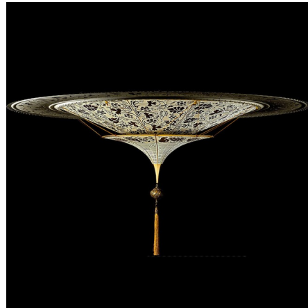
Shown in brown floral

Immerse yourself in the enchanting tales of the Arabian Nights with the Scheherazade Silk Ring Ceiling Semi-Flush Light. Imagine by the famed storyteller herself, this exquisite Italian-made fixture features two tiers of beautifully inverted pagoda-shaped silk shades, creating a captivating silhouette. The delicate silk is perfectly complemented by an intricate net of cords, adorned with shimmering Murano glass beads and a detailed metal ring, adding layers of sophisticated charm. Available in serene Plain Ivory, vibrant Brown Floral, lush Green Herbarium, or intricate Brown Geometric patterns, the Scheherazade Ceiling Light brings a touch of global elegance, traditional artistry, and contemporary refinement to any room. Ideal for bedrooms, living areas, or hallways where a unique and luxurious overhead light is desired.