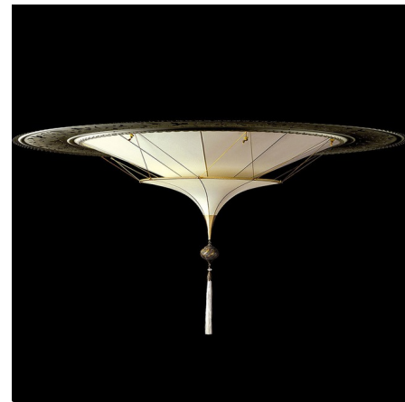
Shown in ivory plain

Immerse yourself in the enchanting tales of the Arabian Nights with the Scheherazade Silk Ring Ceiling Semi-Flush Light. Imagine by the famed storyteller herself, this exquisite Italian-made fixture features two tiers of beautifully inverted pagoda-shaped silk shades, creating a captivating silhouette. The delicate silk is perfectly complemented by an intricate net of cords, adorned with shimmering Murano glass beads and a detailed metal ring, adding layers of sophisticated charm. Available in serene Plain Ivory, vibrant Brown Floral, lush Green Herbarium, or intricate Brown Geometric patterns, the Scheherazade Ceiling Light brings a touch of global elegance, traditional artistry, and contemporary refinement to any room. Ideal for bedrooms, living areas, or hallways where a unique and luxurious overhead light is desired.