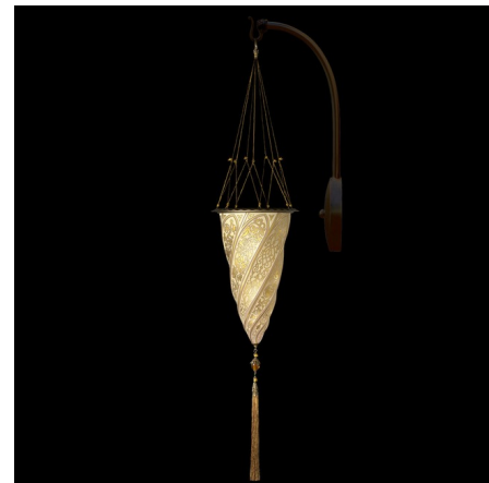
Shown in brass / ivory classic silk

The Cesendello Silk Arc Wall Sconce is designed after the sanctuary lamps whose roots are born in Rome and Byzantium. The decorative silk shade is complemented by a decorative trim and a tassel. Available with Ivory Classic, Ochre Classic, Salmon Classic, Sage Grey Classic, and Light Blue classic silk shades in 1 and 3 light options. Tassel is 11.5 inches in length. Made in Italy.