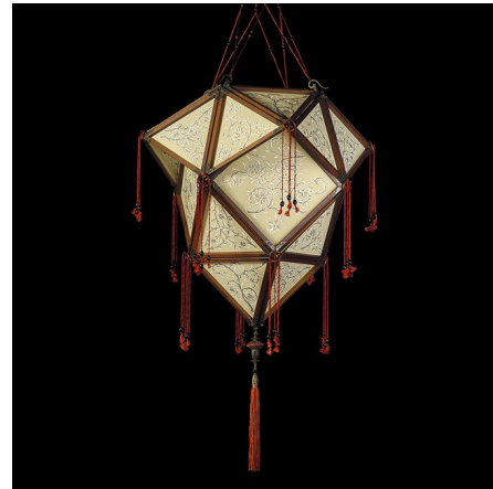
Shown in brass / ivory classic silk

Evoking the allure of a forbidden secret, the Concubina Proibita Silk Pendant is a true masterpiece of design, bringing an unmatched sense of luxury and intrigue to any space. Handcrafted in Italy, this captivating fixture features an artistic arrangement of larger squares and smaller triangles crafted from exquisite Ivory Classic or Ivory Plain silk. These delicate silk panels are beautifully framed by rich wood, accented with lustrous brass details and vibrant fiery red threads, creating a visually stunning interplay of textures and colors. This pendant is a bold statement piece, seamlessly blending contemporary aesthetics with glamorous appeal, profound global inspiration, and transitional versatility. Perfect for creating a luxurious focal point in living rooms, dining areas, or master suites, where a unique and sophisticated presence is desired. Note: The overall height is not adjustable and must be specified at the time of order.