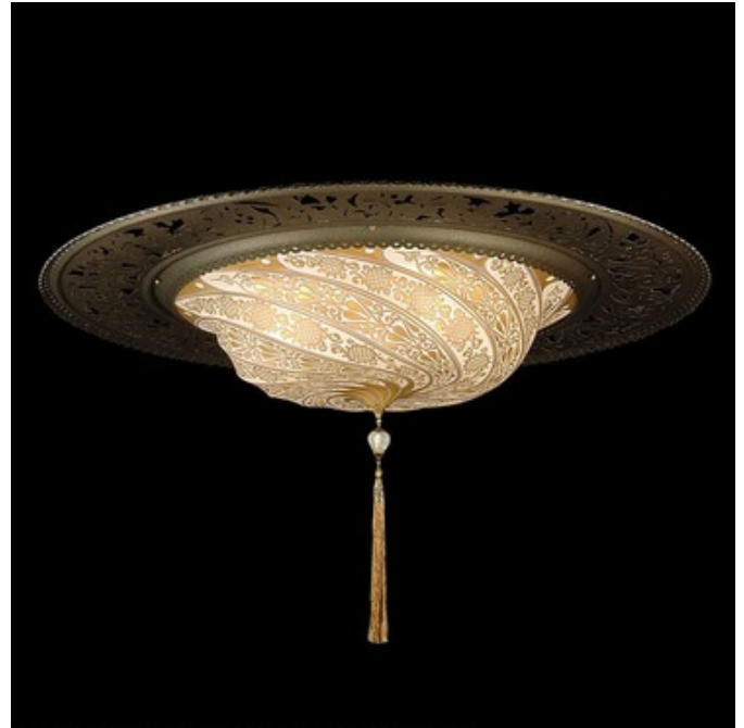
Shown in: Brass / Gold Classic

The Scudo Saraceno Large Glass Ring Ceiling Flush Light is inspired by the Saraceno Shield from Medieval times. The delicate silk is complemented by striking details with a brass finish, decorative ring in a stylistic Turkish -Venetian motif. Available in Gold Classic, Silver Classic, Red Mosaic, or Gold Mosaic. Made in Italy.