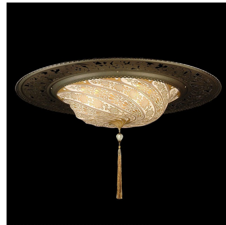
Shown in brass / gold classic

Make an indelible mark with the Scudo Saraceno Large Glass Ring Ceiling Flush Light, a powerful and elegant fixture inspired by the protective Saracen shields of Medieval times. Made in Italy, this substantial ceiling light features exquisite glass, beautifully complemented by a sophisticated brass finish and a distinctive decorative ring, all united in a captivating Turkish-Venetian motif. Available in luxurious Gold Classic, Silver Classic, Red Mosaic, or Gold Mosaic finishes, the Scudo Saraceno Large Glass Ring Ceiling Light offers unparalleled grandeur and versatility. It's an ideal choice for grand entryways, expansive living areas, or dining rooms, where it delivers a striking blend of contemporary design, global artistry, and traditional elegance, creating a truly opulent overhead presence.