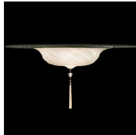
Shown in brass / white classic

Infuse your overhead space with the rich narrative of history and design with the Scudo Saraceno Glass Ring Ceiling Flush Light. Drawing inspiration from the protective Saracen shields of Medieval times, this Italian-made fixture offers striking details, featuring a refined brass finish and a distinctive decorative ring, all united by a captivating Turkish-Venetian motif. Choose from a magnificent array of finishes including Gold Classic, White Classic, Silver Classic, Ivory Plain, Ivory Serpentine, Ivory Classic, Red Mosaic, or Gold Mosaic to perfectly complement your interior. The Scudo Saraceno Glass Ring Ceiling Light is an ideal choice for grand entryways, expansive living areas, or dining rooms, where it delivers a striking blend of contemporary design, global artistry, and traditional elegance, creating a truly opulent overhead presence.