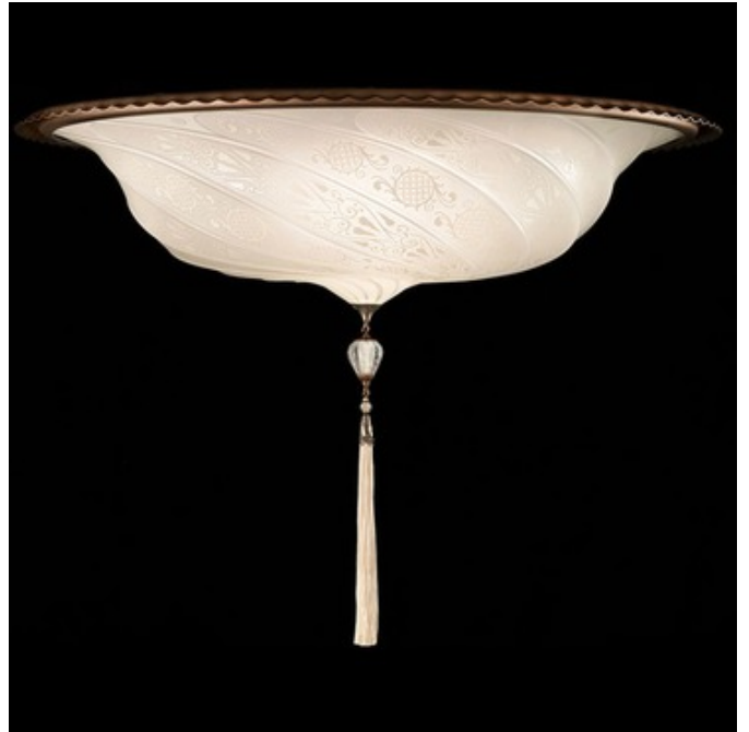
Shown in: Brass / White Classic

The Scudo Saraceno Glass Ceiling Light is inspired by the Saraceno Shield from Medieval times. The delicate silk is complemented by striking details with a brass structure finish and a dark brown canopy in a stylistic Turkish -Venetian motif. Available in White Classic, Silver Classic, Gold Classic, Red Mosaic, or Gold Mosaic in three sizes. Made in Italy. NOTE: No Gold Classic in smallest size and No White Classic in largest size.