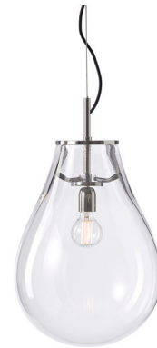
Shown in nickel / clear