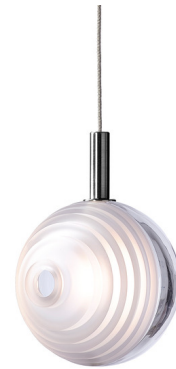
Shown in anthracite / white

PRODUCT DIMENSIONS . . . . . Cord Length: 98.4" COLOR RENDERING . . . . . 80 CRI LAMP COLOR . . . . . 2700K LUMENS/WATT . . . . . 100.00 LUMINOUS FLUX . . . . . 120 lumens