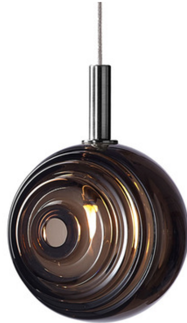
Shown in: Anthracite / Cigar

The Dark Star Pendant is a small lighted object that is powerful in both design and craft. The light source is at the end of a pipe finished in Brushed Gold or Anthracite and then is placed within the mouth-blown glass piece, creating the shining center of a precisely cut Cigar colored crystal star. This fixture holds its own as a solitaire pendant, but makes a bigger impact when hung in multiples. TRIAC dimming..Note: Canopy provided (2.4 inch diameter) is smaller than standard US junction box. Ships with a white paintable j-box cover that fits over a standard 4 inch US canopy.