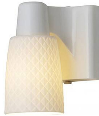
Shown in natural white

The Oxford 1 Bone Wall Sconce exudes quality while creating an interesting tonal illumination, as light plays on the shade's surface. The quilted pitched Natural White Bone China shade is complemented by a handmade Stoke-on-Trent Bone China base. Made in the UK. UL listed.