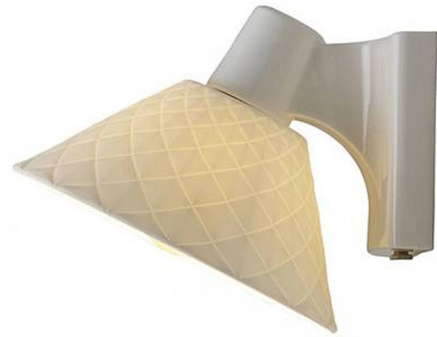
Shown in natural white

The Oxford 2 Bone Wall Sconce exudes quality while creating an interesting tonal illumination, as light plays on the shade's surface. The quilted conical Natural White Bone China shade is complemented by a handmade Stoke-on-Trent Bone China base. Made in the UK. UL listed.