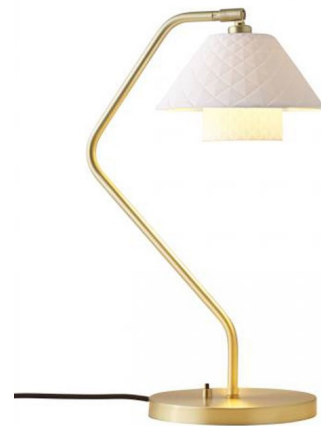
Shown in satin brass / natural white