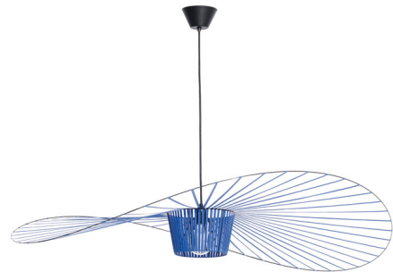
Shown in black / cobalt blue

The Vertigo Pendant is simultaneously ethereal and graphic, adapting to both large and small spaces where it creates its own intimate space. With its ultra light fiberglass structure, stretched with velvety polyurethane ribbons, this pendant lamp fascinates as it comes to life swaying in the soft air currents that surround it.