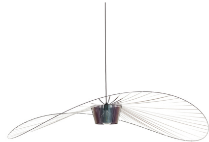
Shown in black / beetle iridescent black

The Vertigo Pendant is simultaneously ethereal and graphic, adapting to both large and small spaces where it creates its own intimate space. With its ultra light fiberglass structure, stretched with velvety polyurethane ribbons, this pendant lamp fascinates as it comes to life swaying in the soft air currents that surround it.