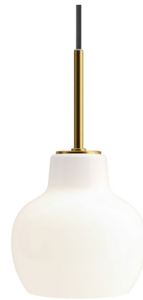
Shown in polished brass / opal

PRODUCT DIMENSIONS . . . . . Cable Length: 144"