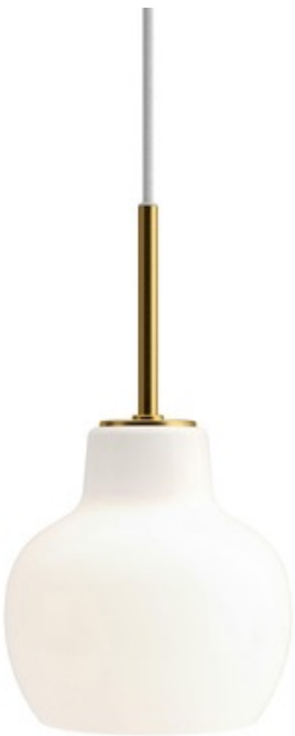
Shown in: Polished Brass / Opal

The VL Ring Crown Pendant, designed by Vilhelm Lauritzen, was created for use in the Danish Broadcasting House in Copenhagen in the 1940s. Brings a distinct and authentic touch to stylish interiors as well as a warm light to softly illuminate contemporary living. It's made of untreated, Polished Brass and glossy white, triple-layered, mouth-blown Opal glass. Canopy: 5 inch diameter. UL listed.