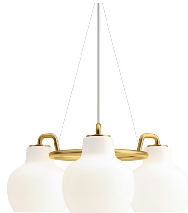
Shown in polished brass / opal

The VL Ring Crown Multi Pendant, designed by Vilhelm Lauritzen, was created for use in the Danish Broadcasting House in Copenhagen in the 1940s. Brings a distinct and authentic touch to stylish interiors as well as a warm light to softly illuminate contemporary living. It's made of untreated, Polished Brass and glossy white, triple-layered, mouth-blown Opal glass. Available in 3, 5, and 7 light options. Canopy: 5 inch diameter. UL listed.