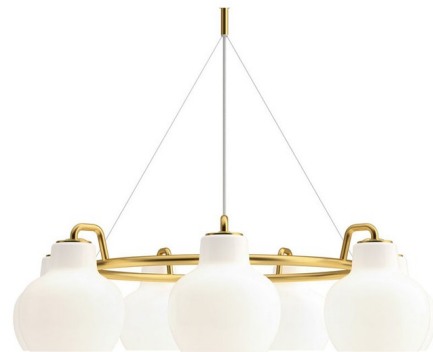
Shown in polished brass / opal

The VL Ring Crown Multi Pendant, designed by Vilhelm Lauritzen, was created for use in the Danish Broadcasting House in Copenhagen in the 1940s. Brings a distinct and authentic touch to stylish interiors as well as a warm light to softly illuminate contemporary living. It's made of untreated, Polished Brass and glossy white, triple-layered, mouth-blown Opal glass. Available in 3, 5, and 7 light options. Canopy: 5 inch diameter. UL listed.