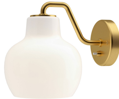
Shown in polished brass / opal

The VL Ring Crown Wall Sconce, designed by Vilhelm Lauritzen, was created for use in the Danish Broadcasting House in Copenhagen in the 1940s. Brings a distinct and authentic touch to stylish interiors as well as a warm light to softly illuminate contemporary living. It's made of untreated, Polished Brass and glossy white, triple-layered, mouth-blown opal glass shades. Available with 1 or 2 lights. UL listed.