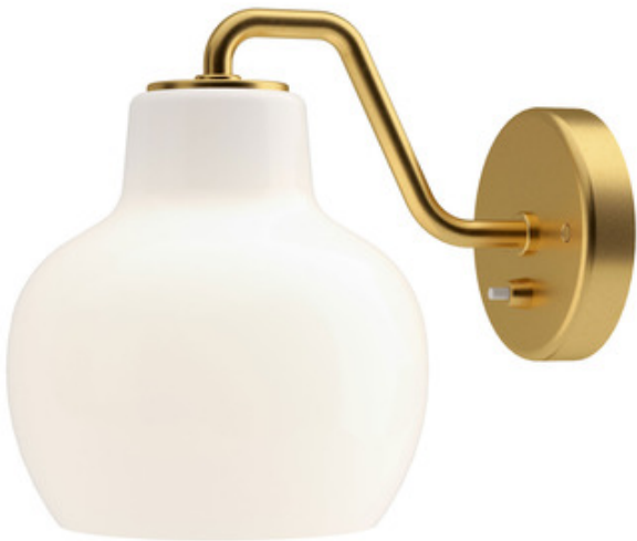
Shown in: Polished Brass / Opal

The VL Ring Crown Wall Sconce, designed by Vilhelm Lauritzen, was created for use in the Danish Broadcasting House in Copenhagen in the 1940s. Brings a distinct and authentic touch to stylish interiors as well as a warm light to softly illuminate contemporary living. It's made of untreated, Polished Brass and glossy white, triple-layered, mouth-blown opal glass shades. Available with 1 or 2 lights. UL listed.