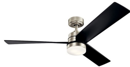
Shown in brushed nickel / black

The Spyn Ceiling Fan features square edges and angles with a contemporary style and industrial look. Available in an Anvil Iron finish with Distressed Antique Gray blades, Brushed Nickel finish with Black blades, or White with Silver blades. Features a 153mm x 17mm AC motor, three non-reversible blades with a 52 inch blade span and 13 degree pitch. Includes a dimmable 17 watt, 120 volt integrated LED light module with an etched cased opal glass diffuser, a 337010 dual slide fan/light control, and one 6 inch downrod. ETL listed. Limited lifetime warranty. Optional downrod lengths and limited function wall or handheld control system sold separately.