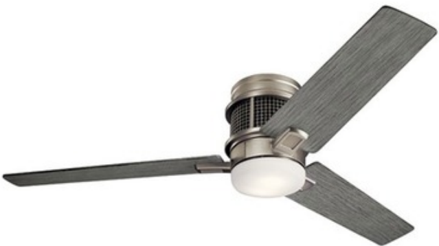
Shown in: Brushed Nickel / Driftwood

The Chiara Ceiling Fan with Light features industrial style with vintage accents with mesh inlays, weathered-wood look blades, and a ceiling hugger design. Available in Olde Bronze with Medium Weathered Oak blades or Brushed Nickel with Driftwood blades. Features a 153mmx20mm AC motor, three non-reversible wood blades with a 52 inch blade sweep, and 12 degree blade pitch. Integrated 17 watt, 120 volt LED light module and etched cased opal glass diffuser. Includes a Limited Function Wall Control System. ETL listed. Limited lifetime warranty. Optional limited function handheld transmitter sold separately.