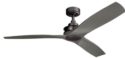
Shown in anvil iron

The Ried Ceiling Fan gives you a wood-blade look in a style that works in damp spaces like an enclosed patio or sunroom. Available in a Brushed Nickel with Medium Walnut ABS blades, Anvil Iron with Driftwood ABS blades, or an Old Bronze finish with Cherry blades. Features a 172mm x 17mm AC induction motor, three non-reversible blades with a 56 inch blade sweep, and 14 degree blade pitch. Includes a 6 inch downrod and a Limited Function Wall Control System with White, Ivory and Almond face plates. ETL listed. Suitable for damp locations. Limited lifetime warranty. Optional downrod lengths, limited function handheld transmitter, and light kit sold separately.